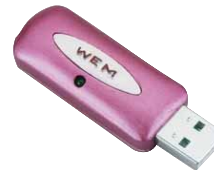
CID : CUA -01