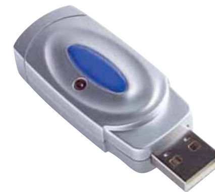
CID : CUA -02